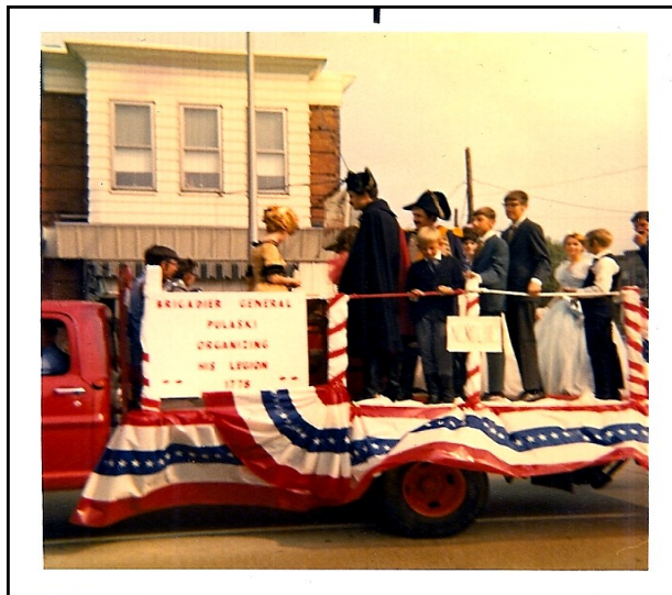
"Pulaski Day Parade 1968"