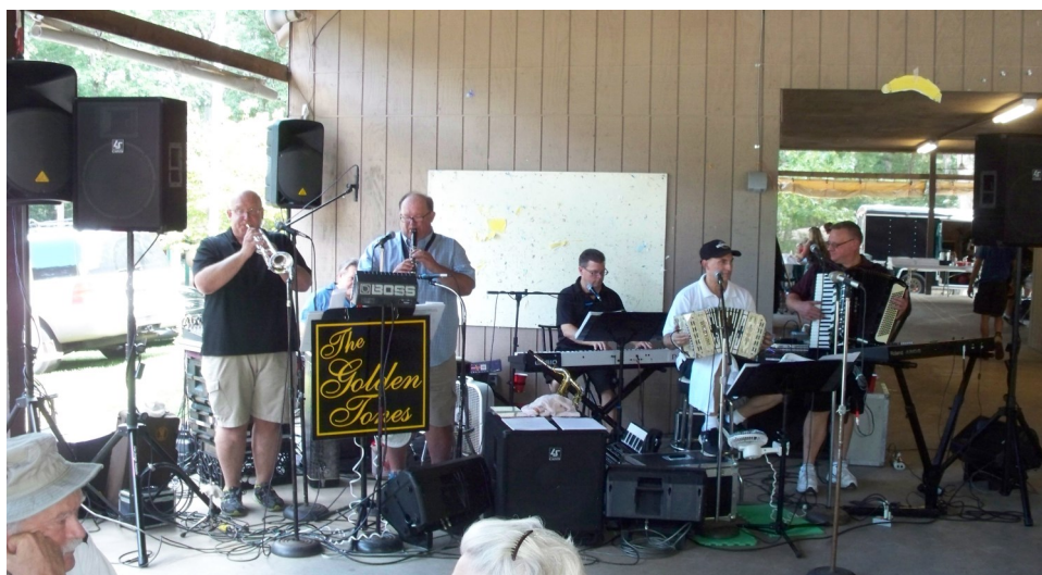
"The Golden Tones Band" performed at this years' PACC Picnic

Visit the PACC website on the Internet, for up to date information at: http://www.pacc1914.org