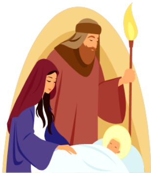
Wesołych Świąt Bożego Narodzenia

Last day to Purchase Tickets is: Monday December 5, 2016